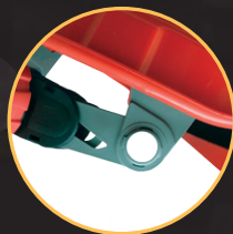
SWivEL feature for Twizloc harness ONLY