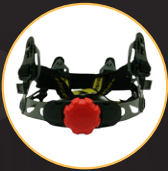
Replaceable CanaSafe helmet suspension (Twizloc)