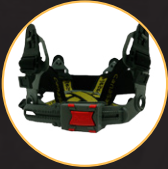
Replaceable CanaSafe helmet suspension (Pushloc)