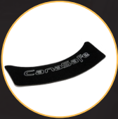
Replaceable CanaSafe sweatband