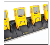
Five unit cradle charger

For a complete list of accessories, please contact BW Technologies by Honeywell.