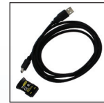
IR connectivity kit