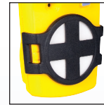
Auxiliary filter kit