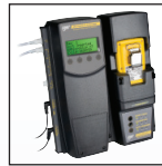
MicroDock II compatible