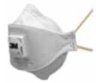
3M™ Aura™ Particulate Respirator 9312+