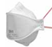
3M™ Aura™ Particulate Respirator 9330+