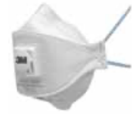
3M™ Aura™ Particulate Respirator 9322+