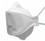
3M™ Aura™ Particulate Respirator 9320+