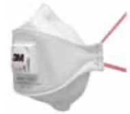
3M™ Aura™ Particulate Respirator 9332+