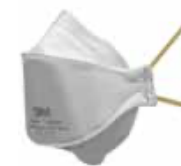
3M™ Aura™ Particulate Respirator 9310+